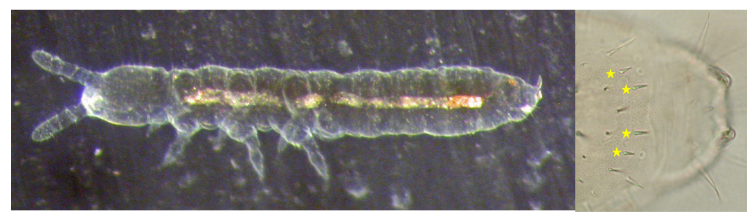
FIGURE 2 . The first record in Norway of Onychiurus edinensis (Bagnall, 1935), found in grass-clover sward in Tingvoll, NW Norway, 2012. Right side, marked with yellow stars, the characteristic thick, spine-like setae on the fifth abdominal segment that identifies this species.

2012. Other common (100-500 individuals recorded) species were Mesaphorura krausbaueri > Mesaphorura macrochaeta > Protaphorura armata > Mesaphorura tenuisensillata >Isotomurus graminis > Stenaphorura lubbocki > Protaphorura cancellata > Folsomia fimetaria > Friesea truncata > Megalothorax minimus. The juveniles of Isotomurus were also common, and were most likely I. graminis or I. unifasciatus, since these were recorded with 147 and 70 individuals, whereas for Isotomurus italicus, only two individuals were recorded. 7 species were found in numbers between 20-99 and for the remaining 22 species, less than 20 individuals were found.