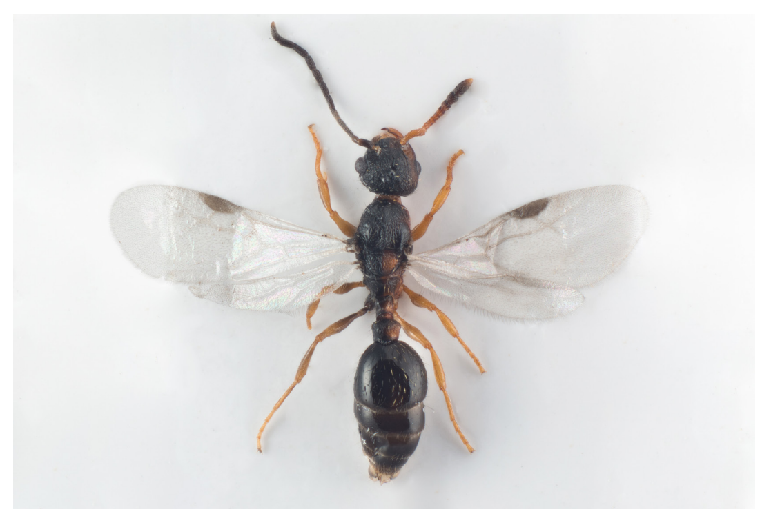
FIGURE 1 . A gynandromorphous specimen of Leptothorax kutteri Buschinger, 1965, showing male characters on the left side and characters of a queen on the right side.