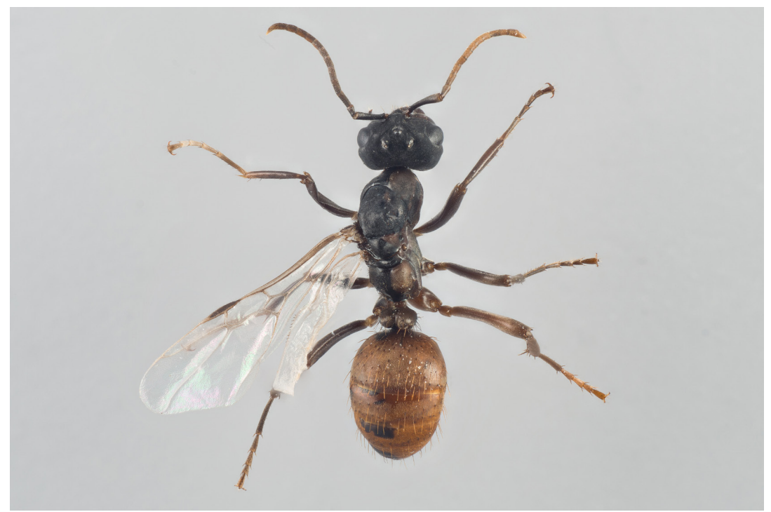
FIGURE 3 . Dorsal view of a gynandromorphous specimen of Polyergus rufescens (Latreille, 1798). Photo: A. Staverløkk (from Ødegaard et al. 2015).