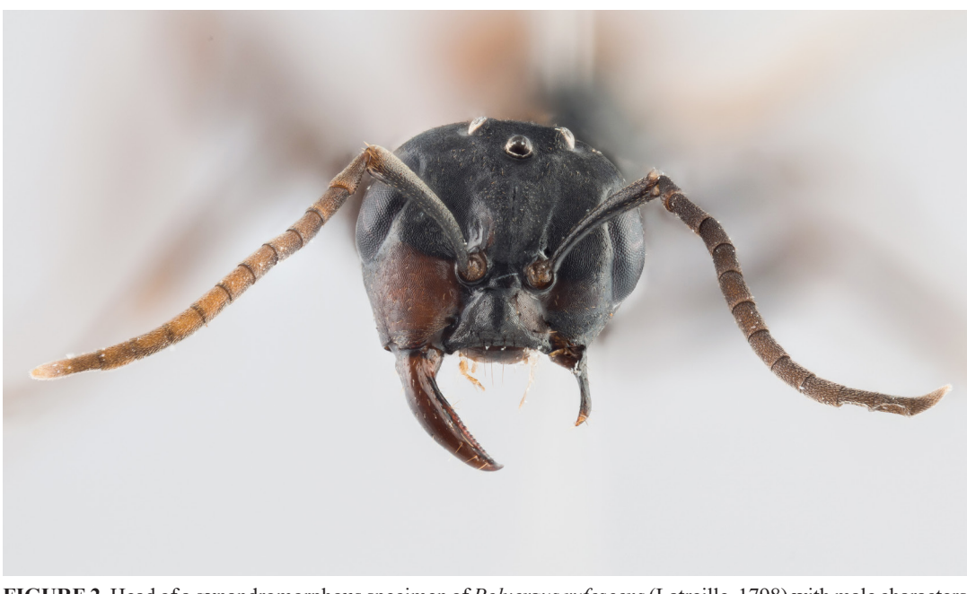
FIGURE 2 . Head of a gynandromorphous specimen of Polyergus rufescens (Latreille, 1798) with male characters on its left side and worker characters on its right side. Photo: A. Staverløkk (from Ødegaard et al. 2015).