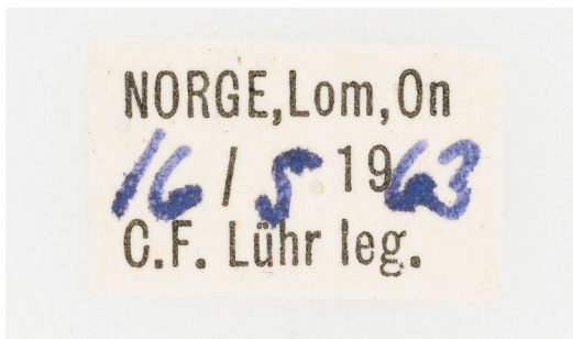
FIGURE 2. The label accompanying the specimen.

fore wing is pale yellowish brown with darker mottles, and with more pronounced dark spots at the apex of the disc cell, at the R-M crossvein, and at the points where the longitudinal veins meet the outer wing margin. The wing tip is slightly notched. In Finland the larva lives in cold, groundwater fed brooks, where it builds straight, cylindrical cases of thin bark pieces (Rinne & Wiberg-Larsen 2017). The species hibernates as adult. The flight in Finland starts in late August, continues until winter, and is resumed in spring, lasting until June (Salokannel & Mattlia 2018). In Dalarna in Sweden, the species has been